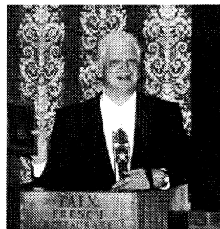
Speaker Ray Romano shows off his plaque, which reads "Friend of Atheists United."