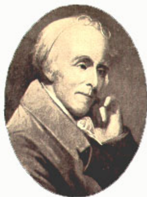
DR. BENJAMIN RUSH