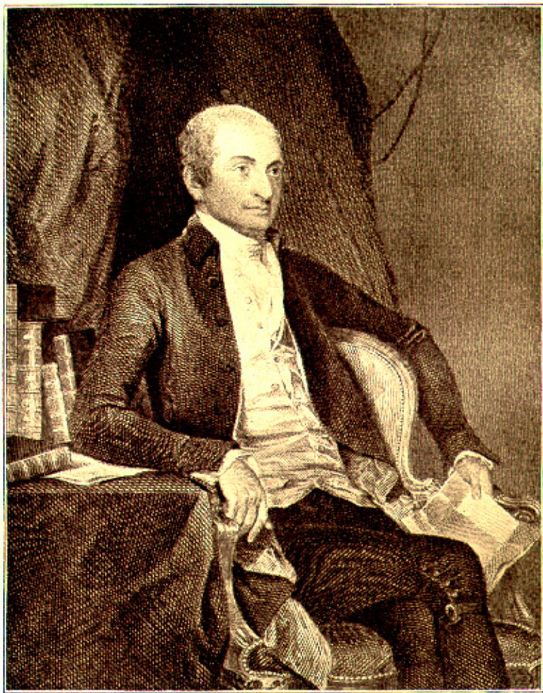
John Jay —