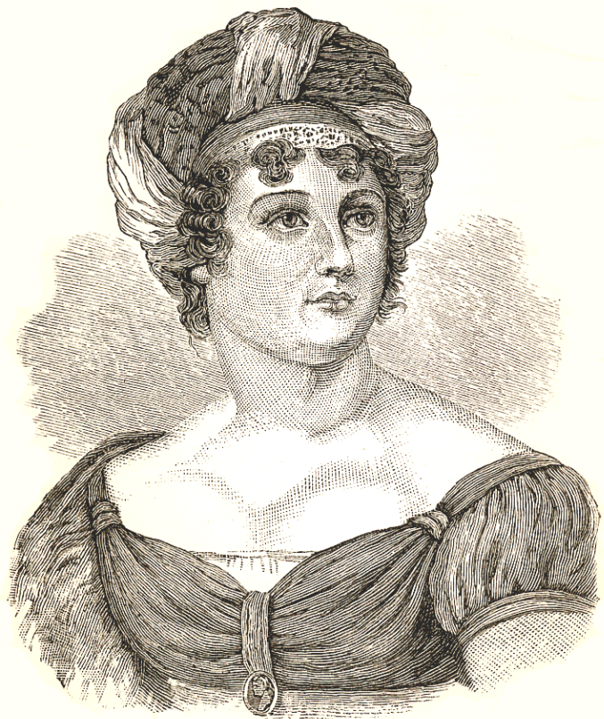
MADAME DE STAËL.