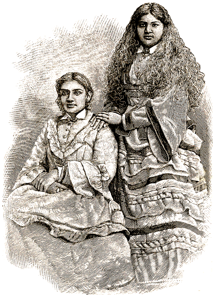
TORU DUTT AND SISTER.