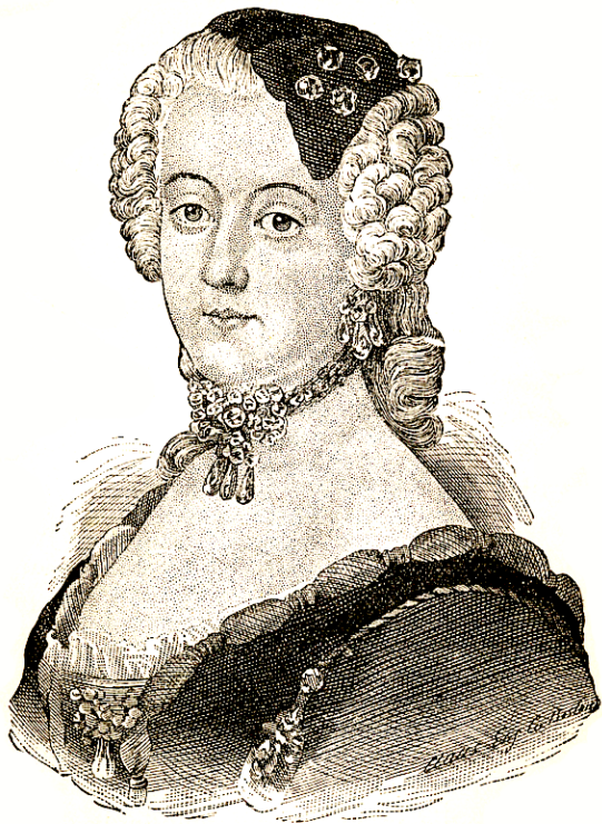
WIFE OF FREDERICK THE GREAT.