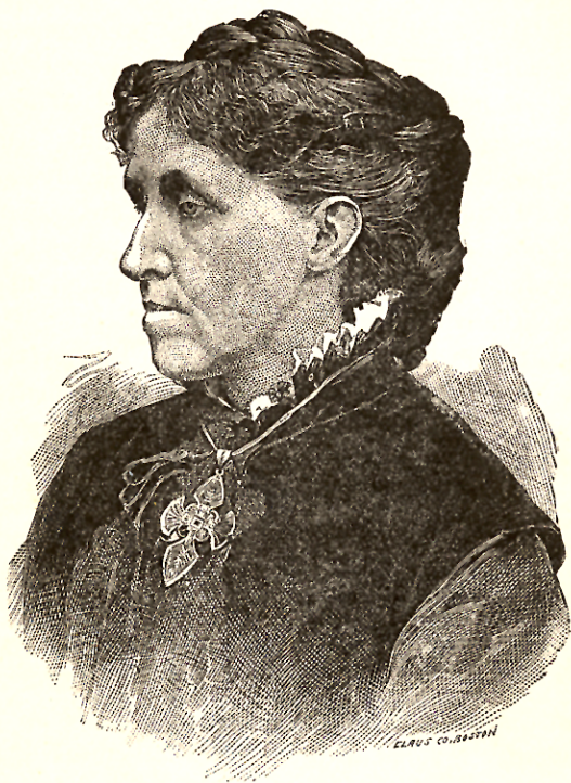
MISS LOUISE M. ALCOTT.