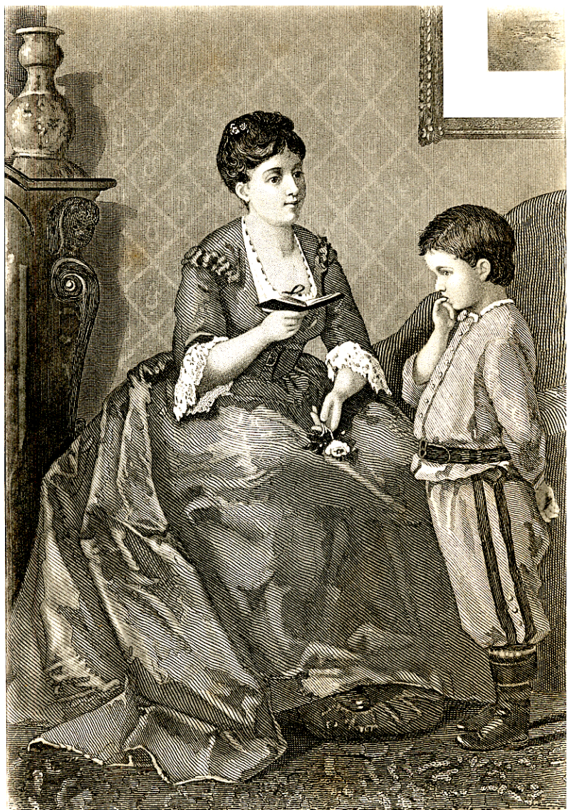
THE MORNING LESSON