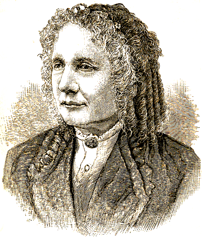
MRS. H. B. STOWE.