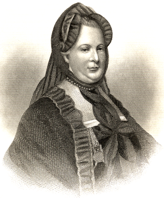
Maria Theresa, Empress Queen of Hungary &c.