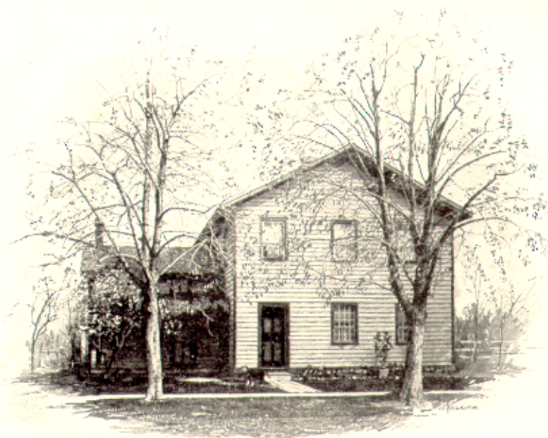
Birthplace of Ingersoll. Dresden, N. Y.