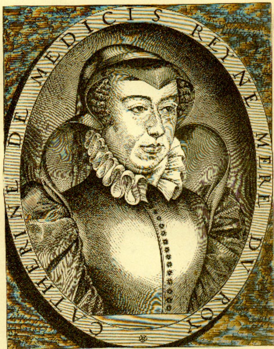
CATHERINE DE MEDICIS.