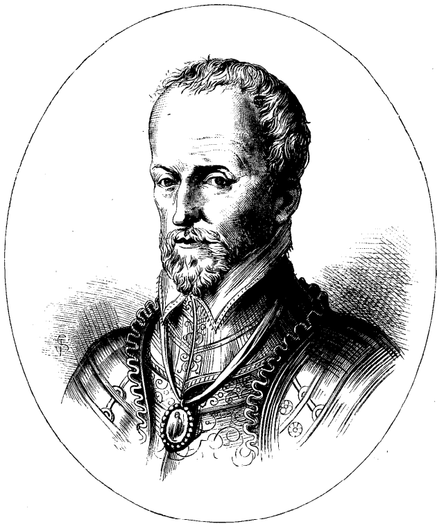
GASPARD DE COLIGNY, ADMIRAL OF FRANCE.